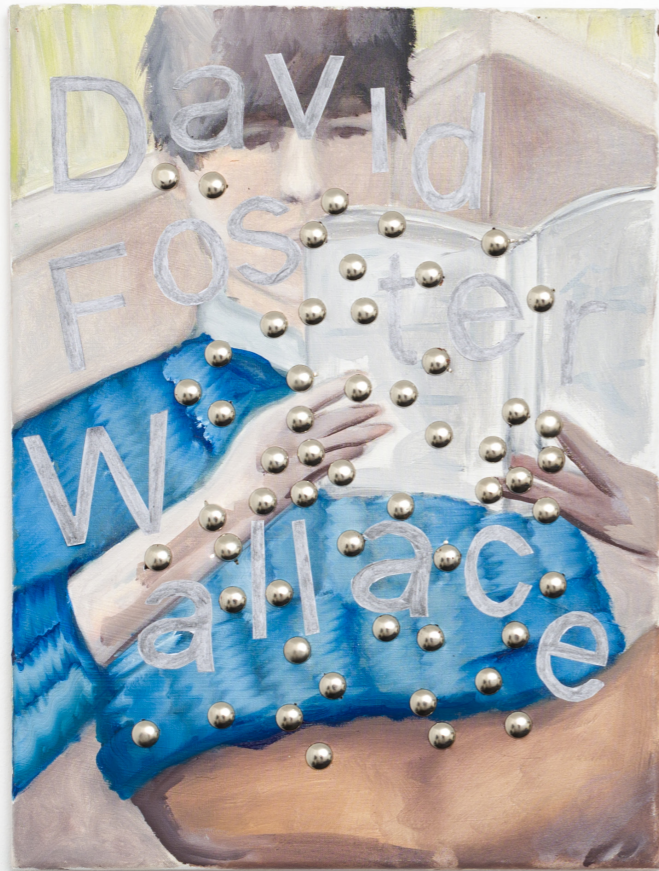
2. Nate Archibald, 2025 25 × 40 cm Olieverf, metalen studs, potlood en papier