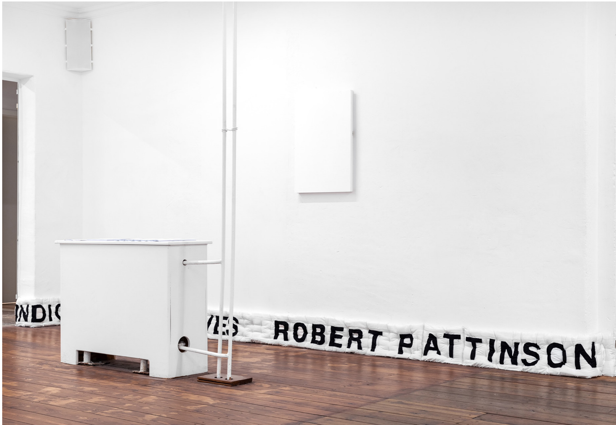
10. Tentoonstellingszicht: Shrine , Studio Hannibal in Berlijn, 2023