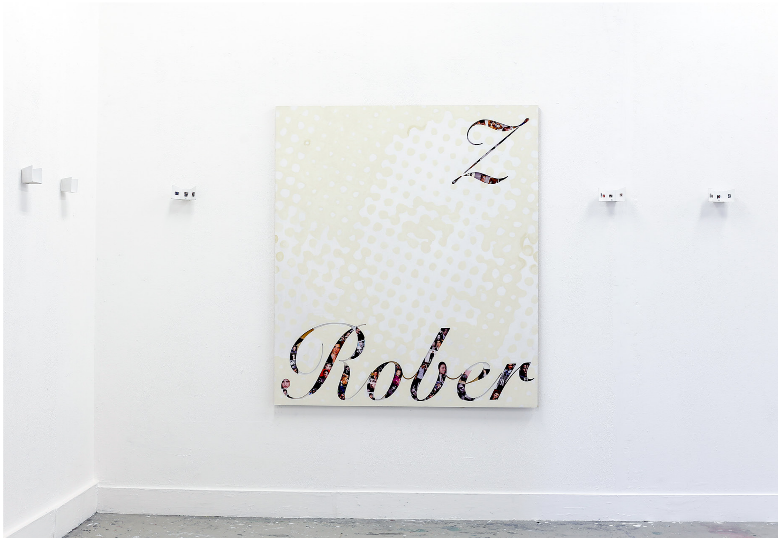
15. Tentoonstellingszicht: Afstudeershow LUCA School of Arts, 2022