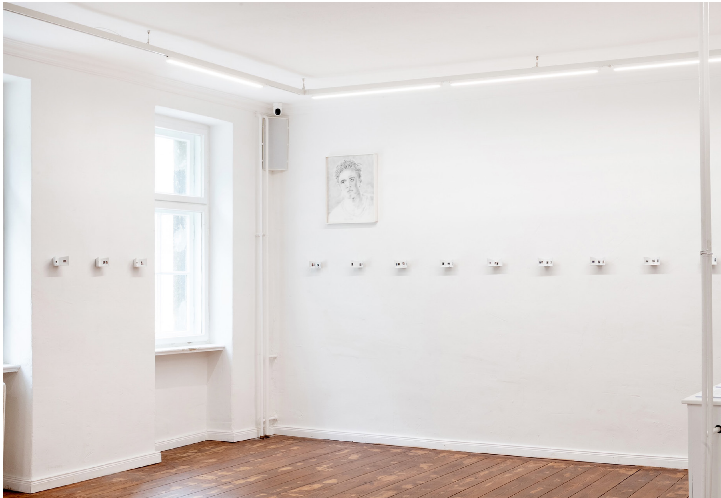
9. Tentoonstellingszicht: Shrine , Studio Hannibal in Berlijn, 2023