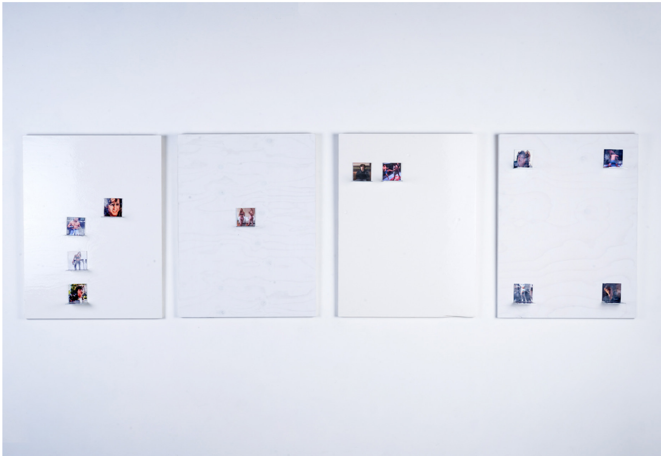
18. MMA / FITGIRLS / TIMOTHEECHALAMET, 2021