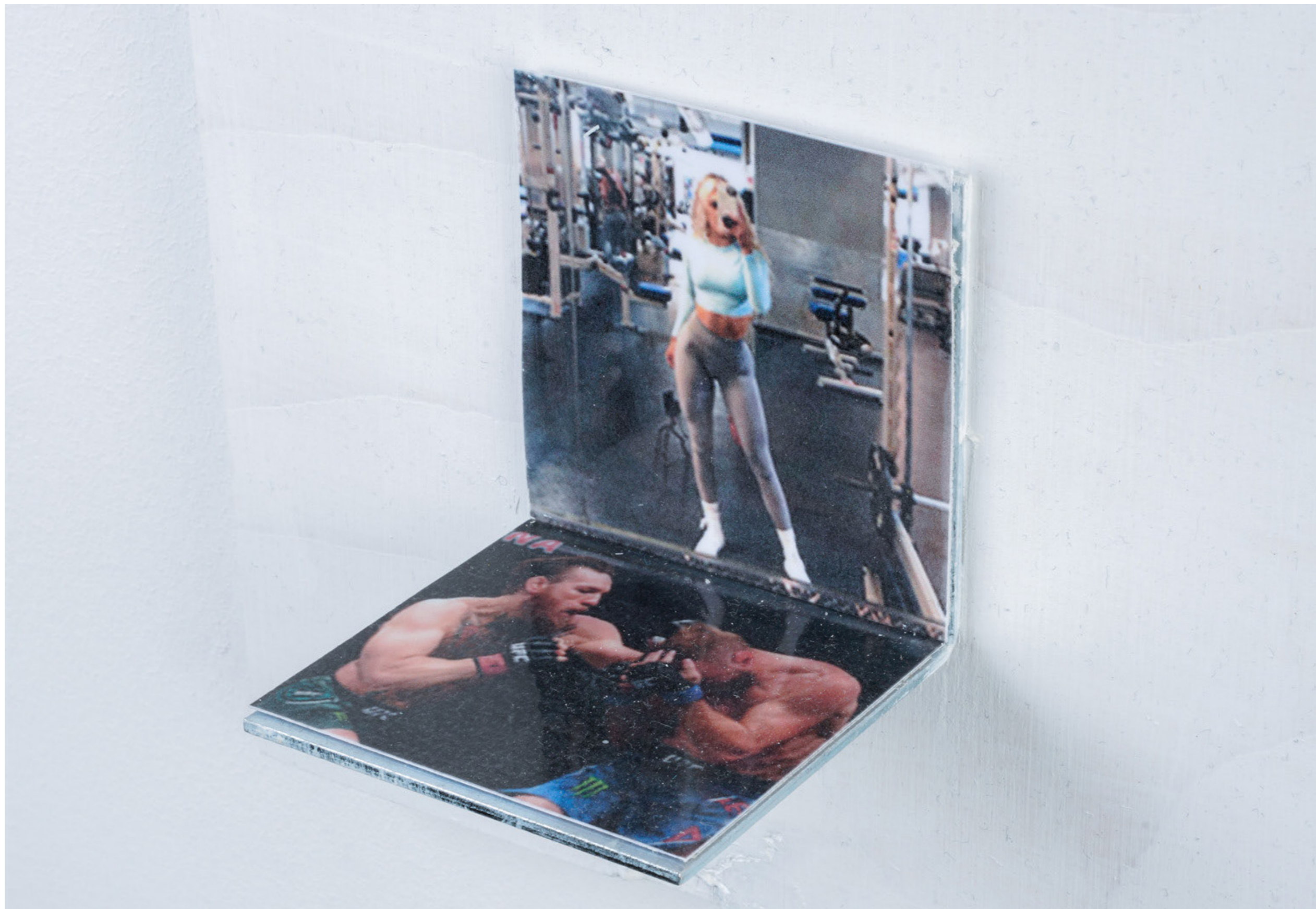
Detail: MMA / FITGIRLS / TIMOTHEE CHALAMET, 2021