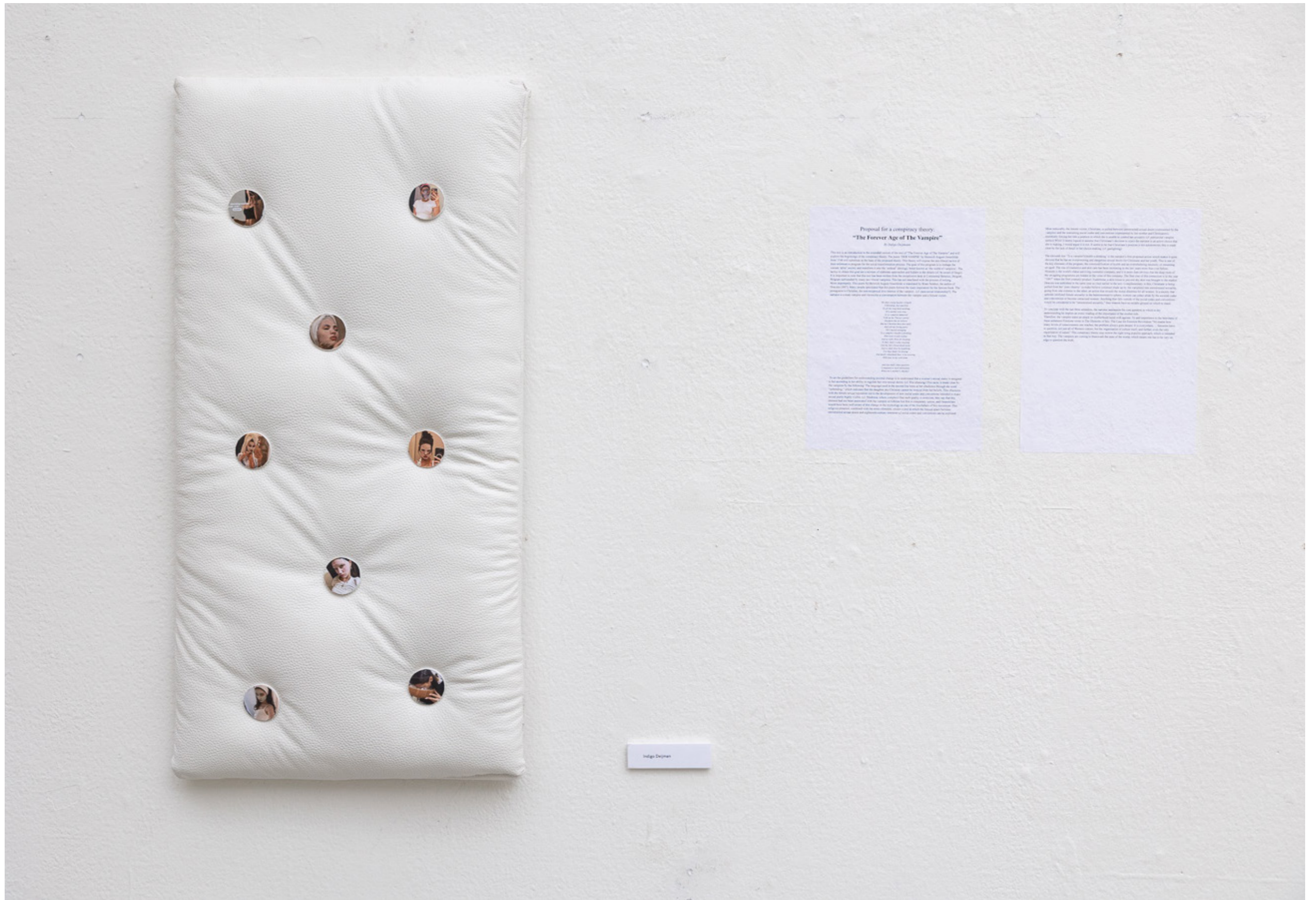
6. Tentoonstellingszicht: Everything is on the One , 2024, Arti et Amicitiae in Amsterdam