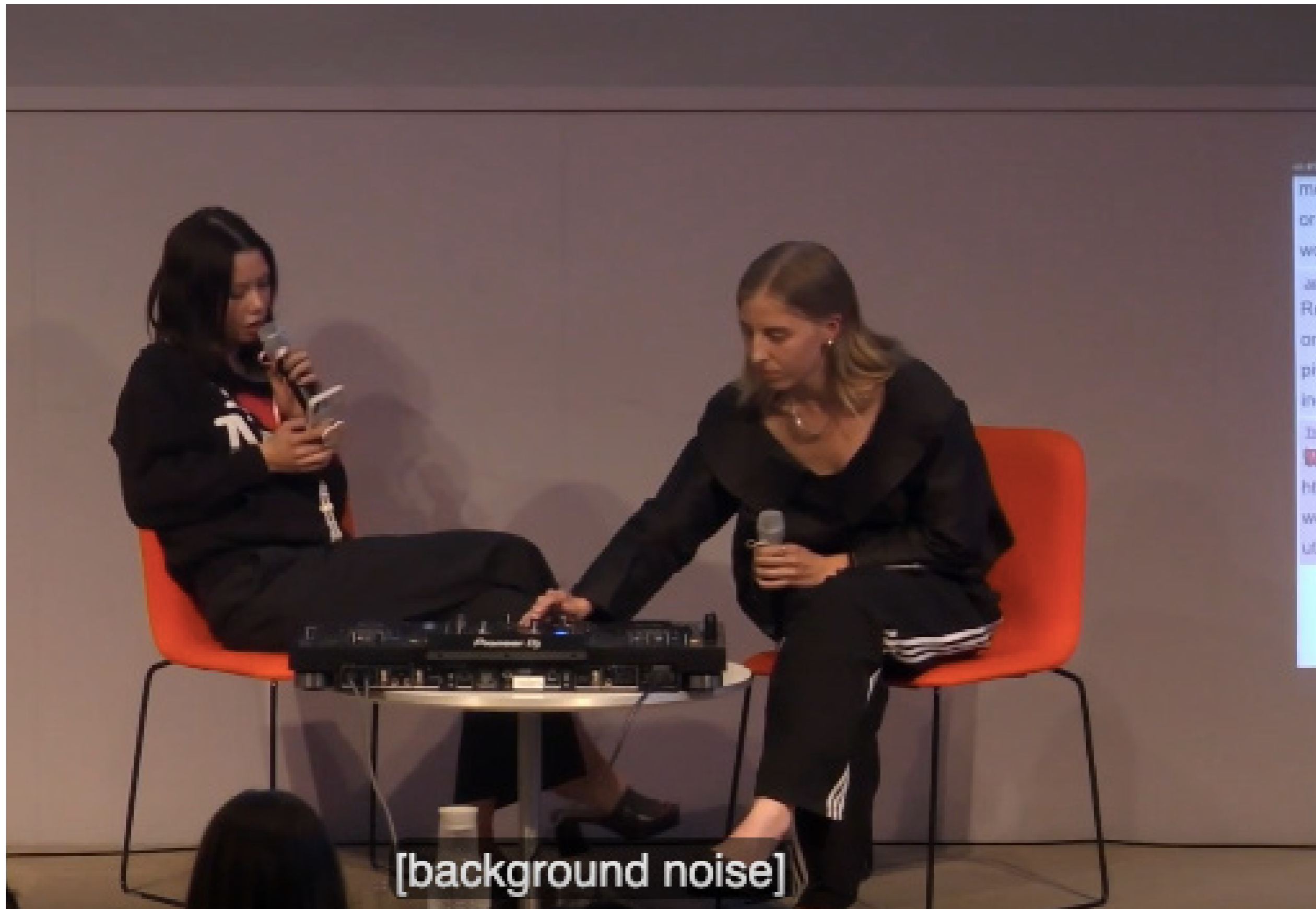
5. DJ Justgirlythings lezing: Coachella/Kylie+Timothee/Hailey Bieber+Anna Boleyn, 2025, Girl Online Symposium', The Hmm, Amsterdam