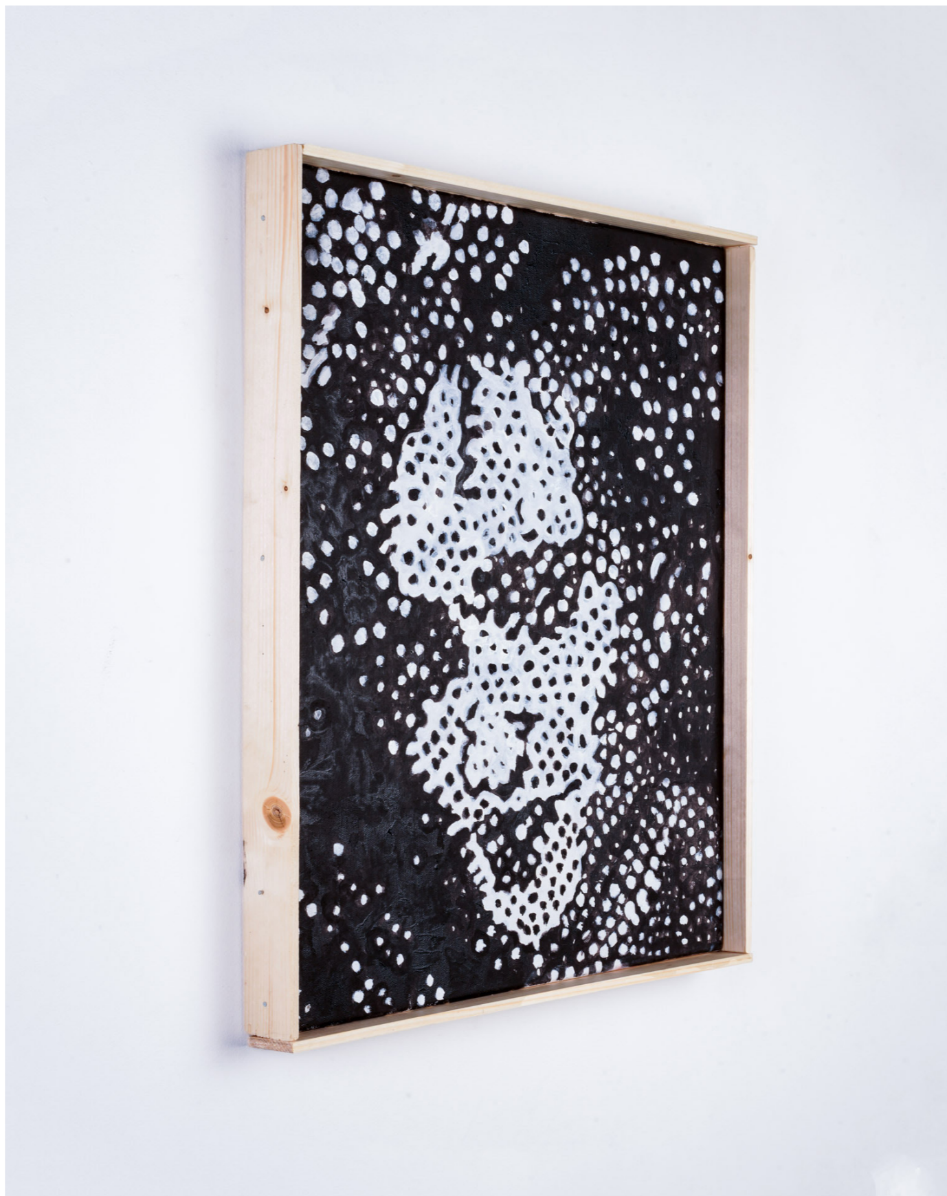
16. Robert Pattinson dots, 2022 45 × 35 cm Olieverf op canvas met houten frame