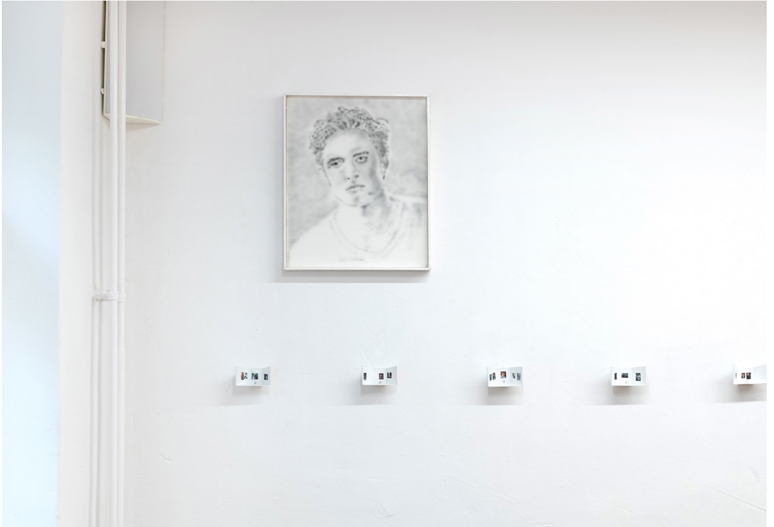
11. Tentoonstellingszicht: Shrine , Studio Hannibal in Berlijn, 2023