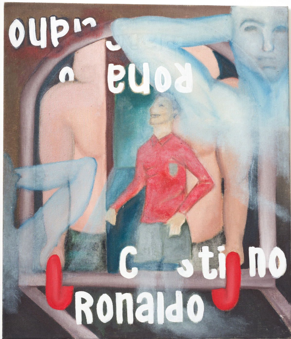
7. Cristiano Ronaldo's Dream World, 2024