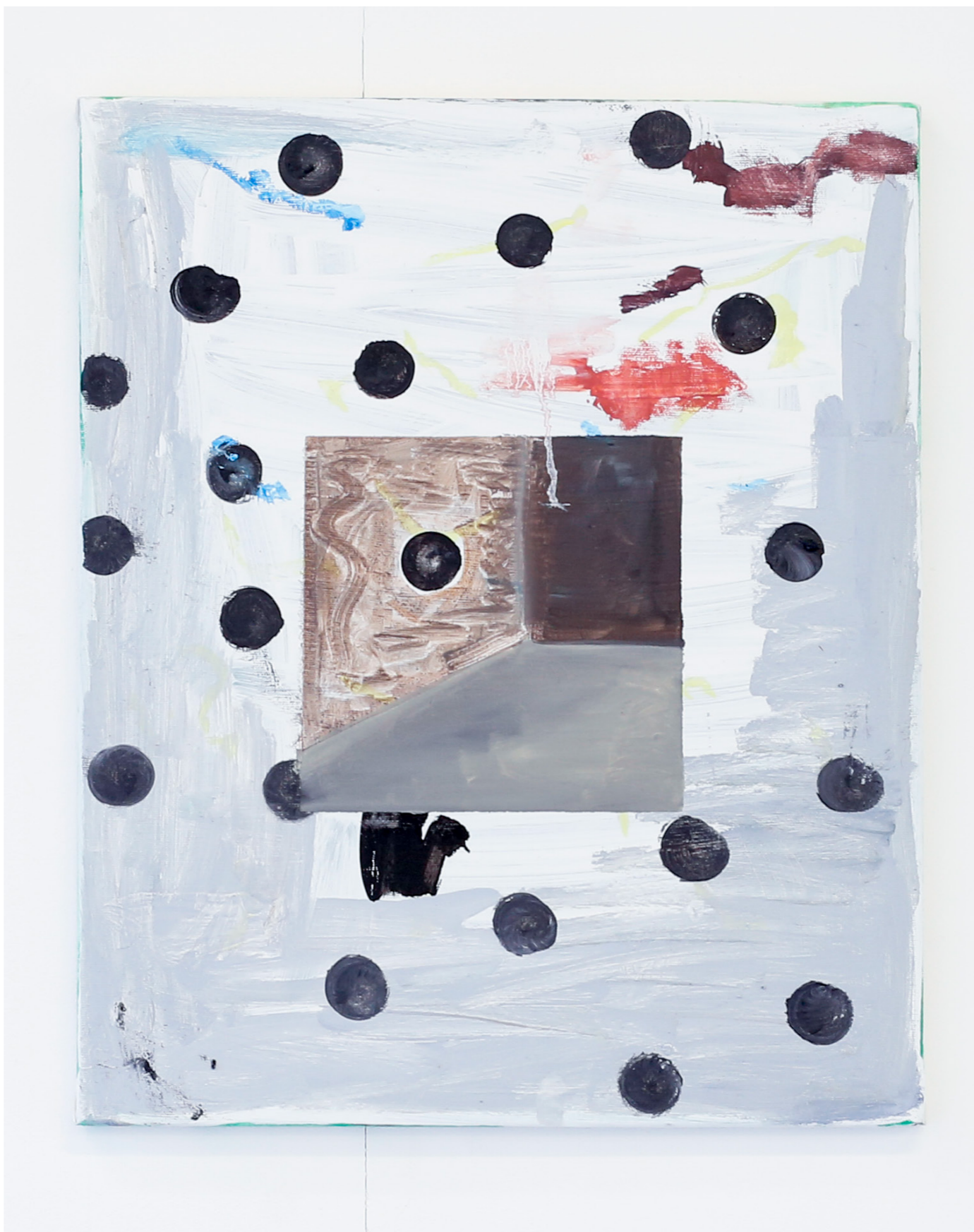
17. Room for Imagination, 2022 35 × 25 cm Olieverf op canvas