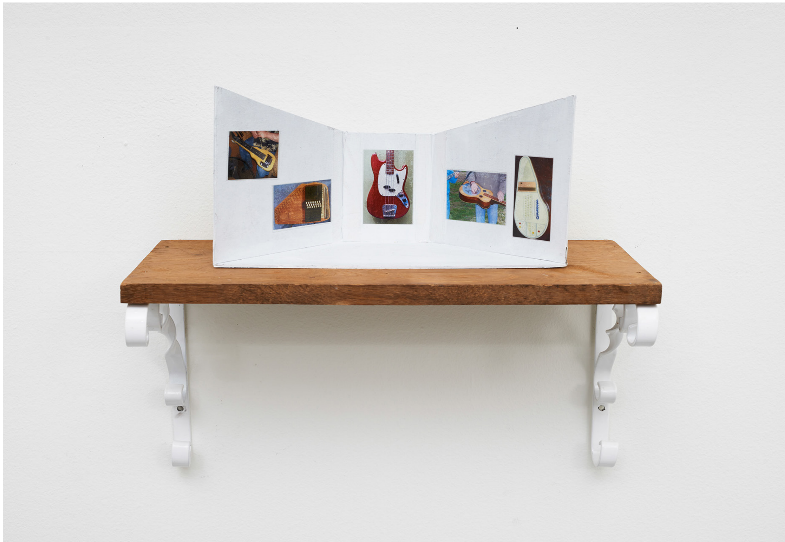
20. Musée des Instruments de Musique, 2021